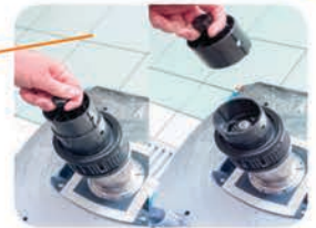
Pump accessed without tools. Suction power 13,208 Gal/ HR