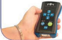
Remote Control 8 functions