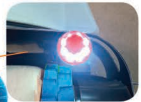
With 2 infra red sensors, tilt sensor