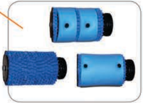
Combination of PVC/PBA or mixed brushes