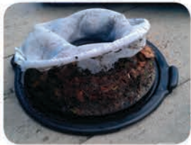
Filtering options 105, 250 or 1000 microns filter bag

NO CABLE TWISTING Equipped as standard with a Gyroscope